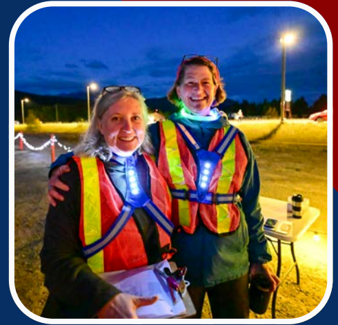
above photo credit: Simon Blakesley previous page photo credit: Michael McCann